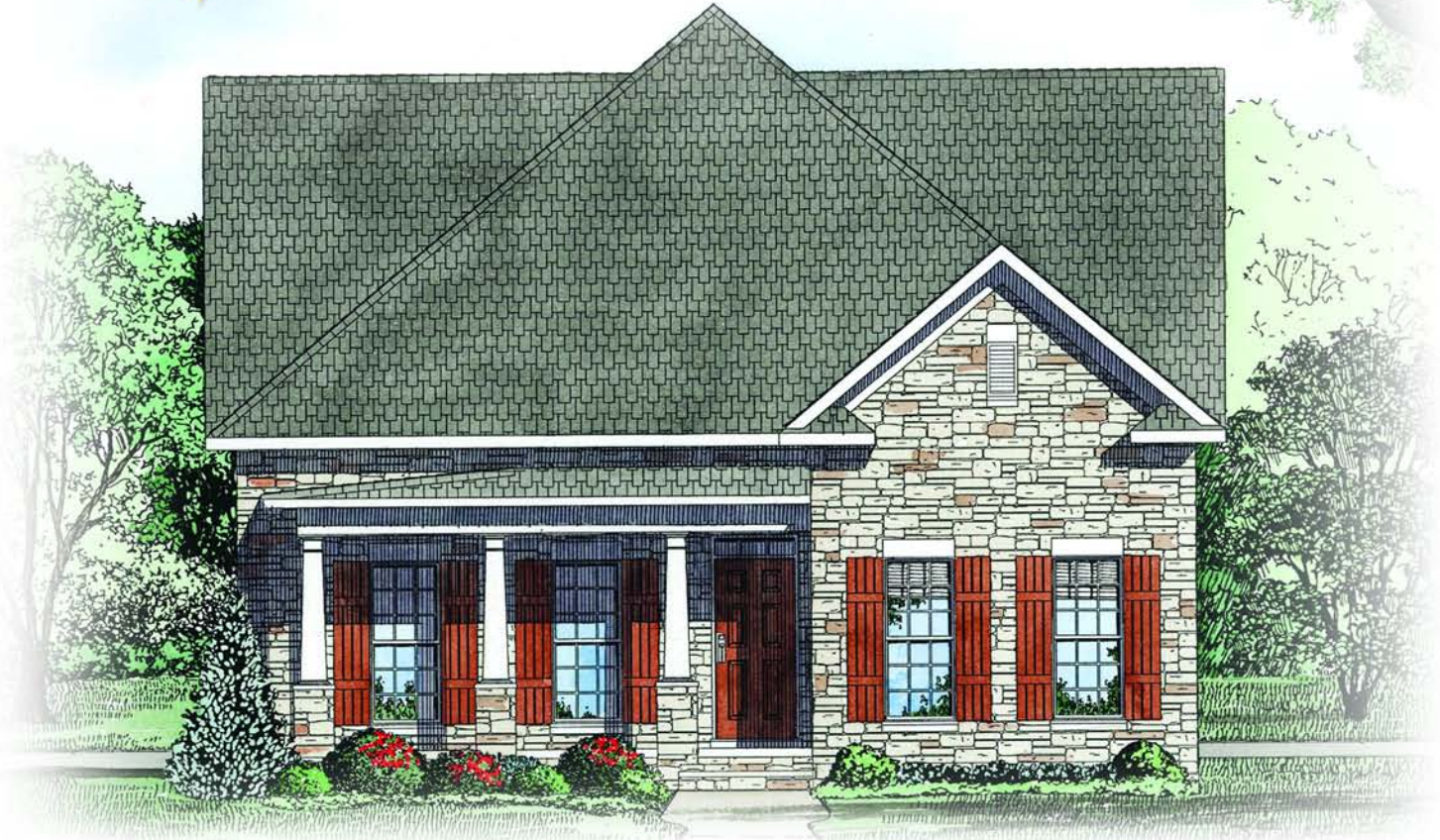
“Elevation C” is shown. Artist Rendering for illustration purposes only. Please review architectural drawings for accuracy.