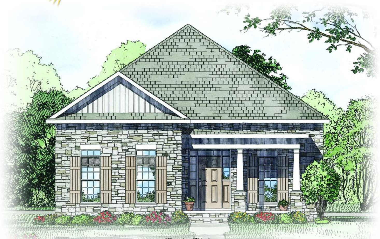
“Elevation C” is shown. Artist Rendering for illustration purposes only. Please review architectural drawings for accuracy.