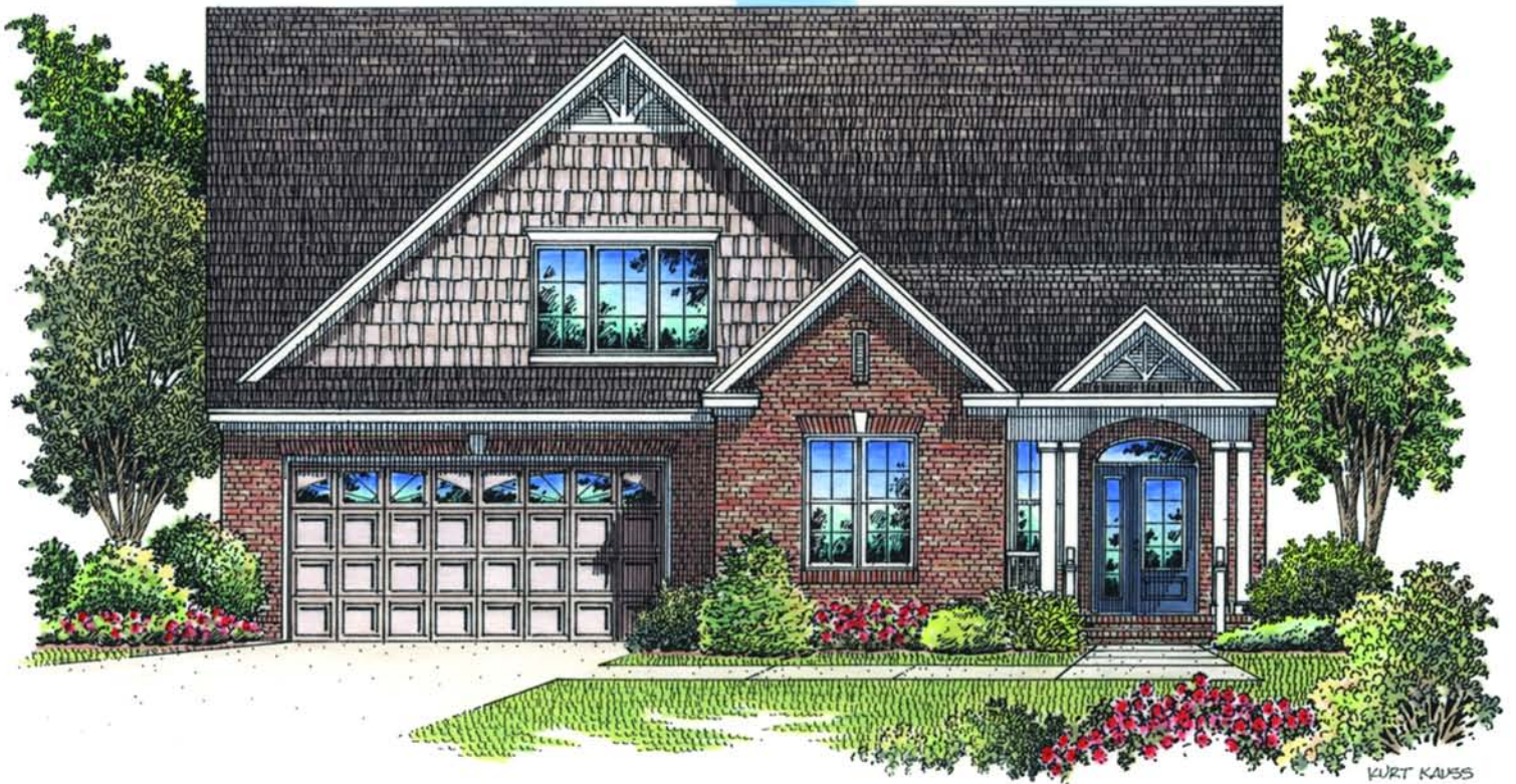
"Elevation B" is shown w/optional rails. Artist Rendering for illustration purposes only. Town code requires double garage doors not shown. Please review architectural drawings for accuracy.